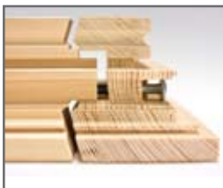
Screwed corner joint

Dowelled corner joint machine versions to be offered. With milling spindle power from 4.0 to 7.5 kW, different shaft lengths, tool holders, and two or four tool heights the KF can be specified to produce your windows and doors with speed and accuracy. By allowing the jointing of pre-profiled timber with perfect splinter free scribes the KF has simplified the manufacture of wooden windows and maintained the classical square shoulder look.