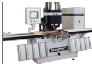
FD-E2: milling for hardware