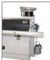
KF: dowelling unit