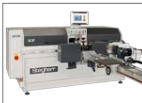
KF with automatic tool changer