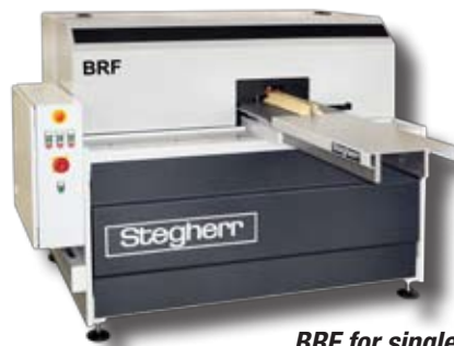
BRF for single end processing

If a flexible handling of a wide variety of frame lengths is requested, the solution is a single end BRF which can mill simultaneously two profiles at one end. For milling the opposite end the bars are turned manually by 180°.