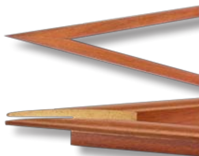
GLS in special execution for cutting angles up to +/-81°

The angles are adjusted either pneumatically or in the machine program over servo controlled axes. Similarly the working stroke can be pneumatic or servo controlled.