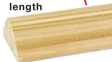
Cutting to length