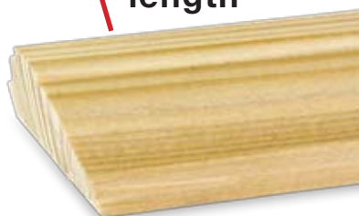
Cutting to length

Stegherr Maschinenbau GmbH & Co KG Fabrikstraße 2-4 D-93128 Regenstauf phone: +49-(0)9402-501-0 fax: +49-(0)9402-501-49 email: sales@stegherr.net www.stegherr.net