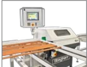
NC Mitre Saw GLS for cutting angles up to +/- 81°