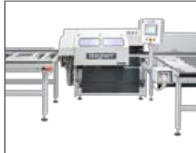
NC Mitre Saw GLS-2 with angle adjustment in two planes